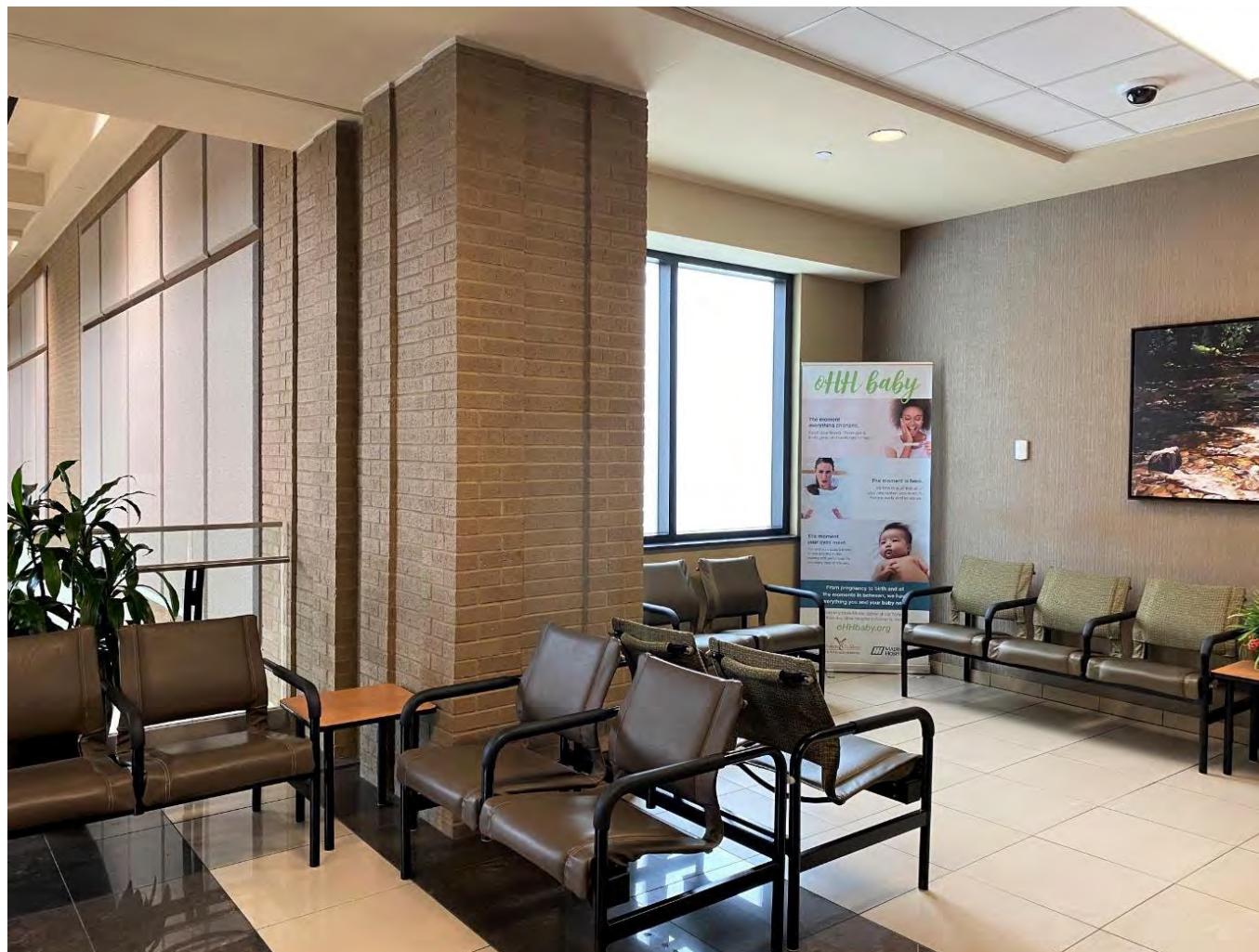
This is the main maternity waiting area on the second floor.